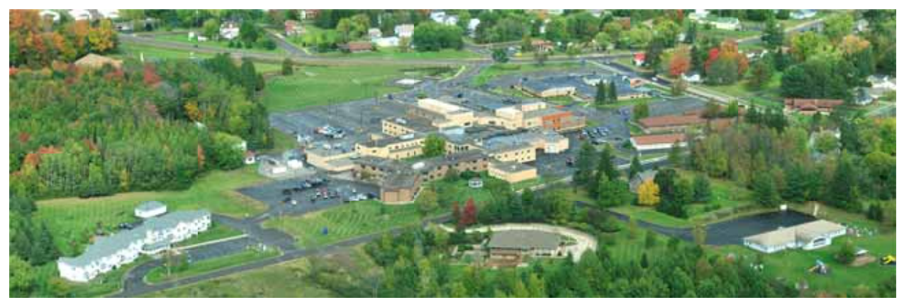
Memorial Health Center Campus, Medford

We take seriously our role as a healthcare provider and steward, promoting health, wellness, and giving back to the community we serve. We, as an organization, and our employees are tremendously active within the communities we serve—volunteering, participating in civic and social organizations, youth sports and academic events, in addition to county services and chamber events.